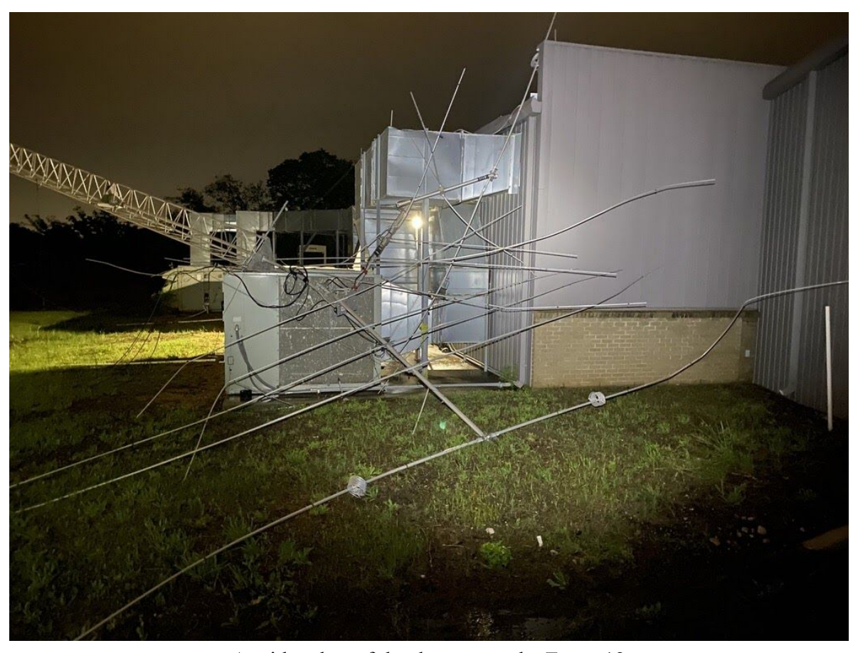
A wider shot of the damage to the Force 12