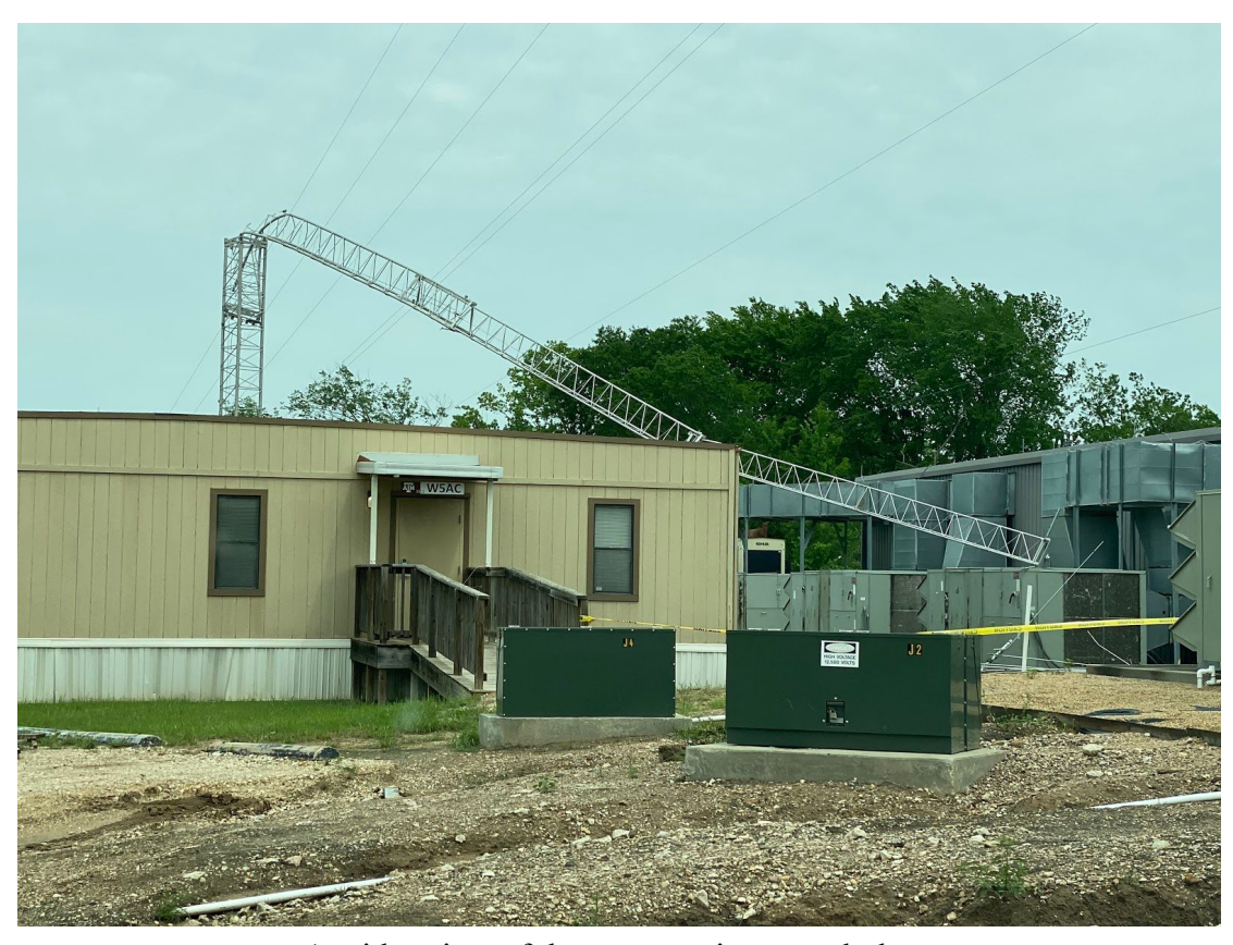
A wider view of the tower as it currently lays