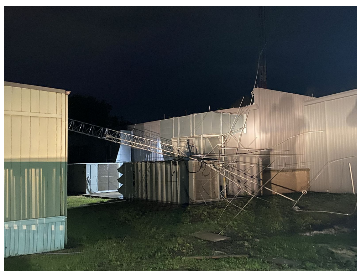
How the tower landed between the two buildings