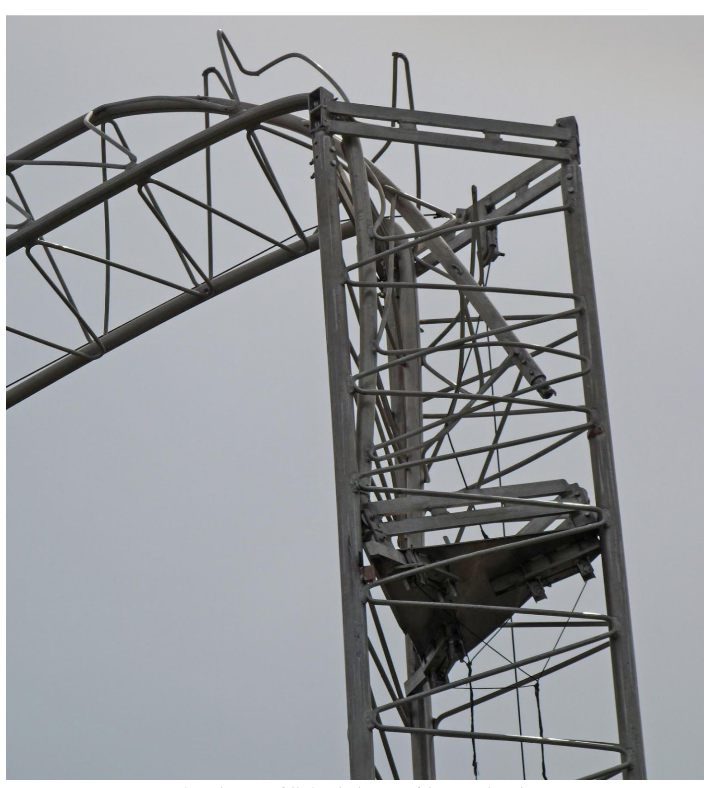
Where the tower failed at the bottom of the second section